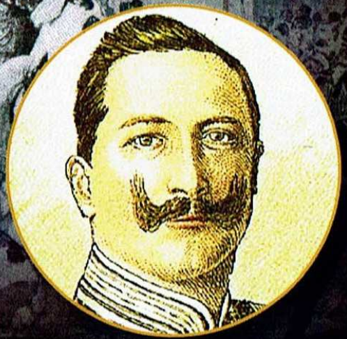
Kaiser Wilhelm II